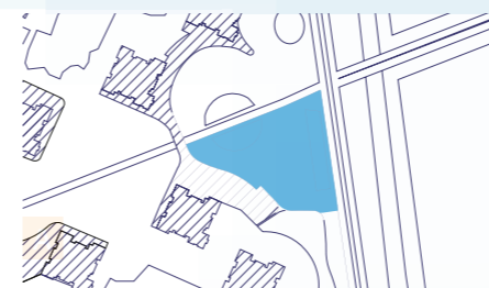
A 澳門新街坊的公共空間 Macau New Neighbourhood