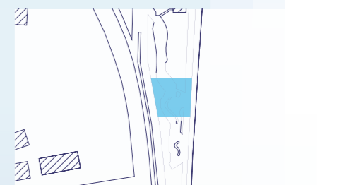
C 橫琴碼頭一側的水濱 Hengqin Pier Waterfront